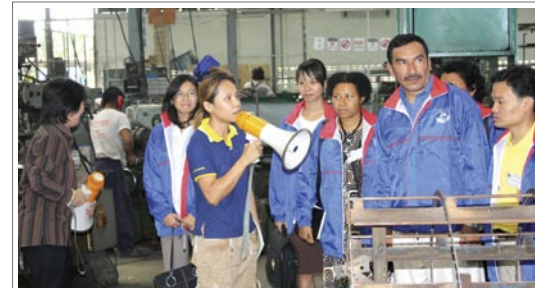
A Thai factory Manager explained her production processes to the participants during their tour of an agriculture machinery factory in Khon Kaen.

Thailand's International Development Cooperation Agency (TICA) sponsored the three-week program, "Leadership in Competitive Enterprises", which was held from July 7 to 25.