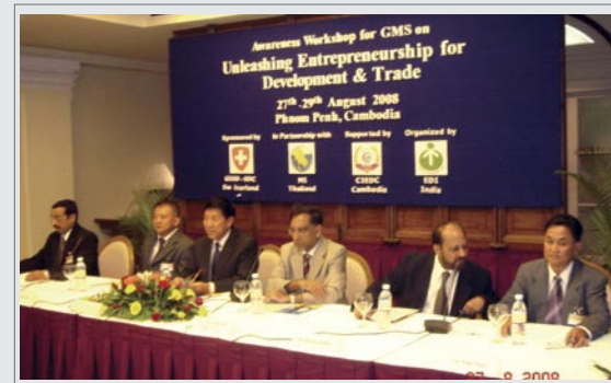
The managements of MI, CIEDC, EDII, plus 35 entrepreneurs and government officials participated in the international trade workshop, organized from August 27-29, 2008 in Phnom Penh, Cambodia.

An international trade workshop, organized by the Cambodia - India Entrepreneurship Development Centre (CIEDC), Entrepreneurship Development Institute of India (EDII) and Mekong Institute (MI), was held in August in Phnom Penh, Cambodia.