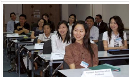
GMS researchers and MI staff participated in the regional research course for a midterm review.

The course was sponsored by New Zealand's International Aid and Development Agency, the Swiss Agency for Development and Cooperation, and the Rockefeller Foundation.