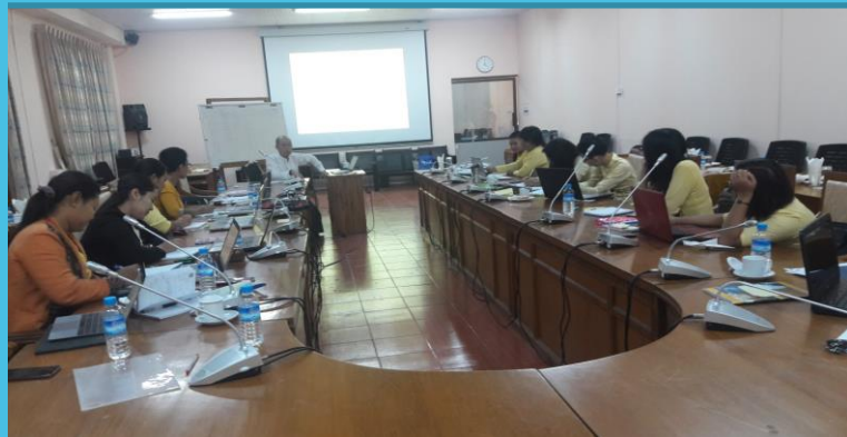
Some Photos of the CAPI and Research Methodology Phase II Trainings