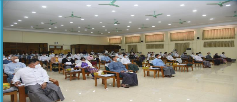
Union Minister U Win Shein and Deputy Minister Daw Than Than Lin attended and gave Opening Speech on SDG and MSDP-NIF Consultation Workshops in Nay Pyi Taw