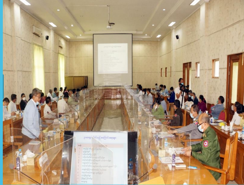
Union Minister U Win Shein gave Opening Speech in Awareness Arising Program of Statistics Law and Rules at Nay Pyi Taw Council