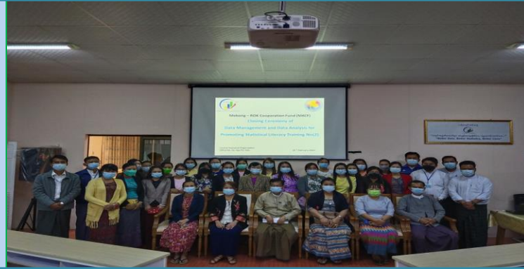
Some Photos of the Capacity Development Trainings